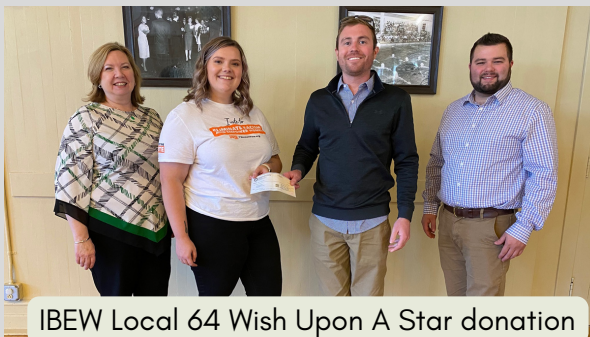
IBEW Local 64 Wish Upon A Star donation

Intended Outcomes: Children and youth receive quality education and build transferrable skills