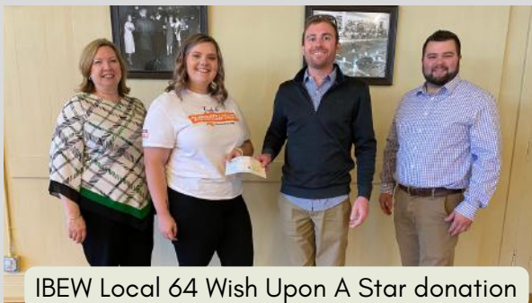
IBEW Local 64 Wish Upon A Star donation

18 children were enrolled in YWCA Discovery Place Early Learning Center which prepares them for kindergarten with a STEAM focus.